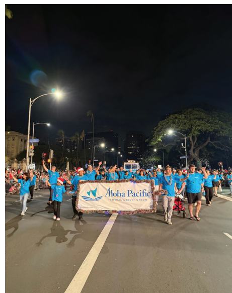
Honolulu City Lights Parade.

The celebration continued on Thursday, Dec. 4, at the Kaimuki Christmas Parade. Team members waved to familiar faces and shared smiles with keiki and kupuna along the route. It was a meaningful way to be part of a long-standing neighborhood tradition.