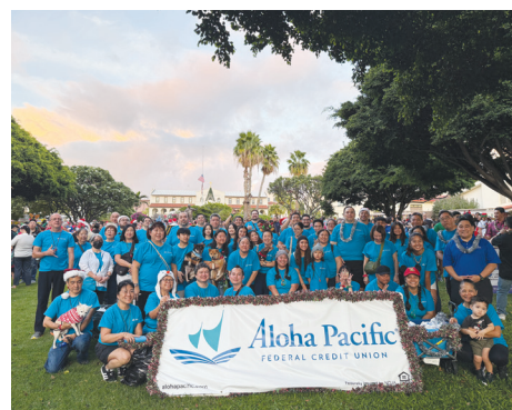
Kaimuki Christmas Parade.

Use Hawaii's happiest HELOC to pay for anything you need, want or do.